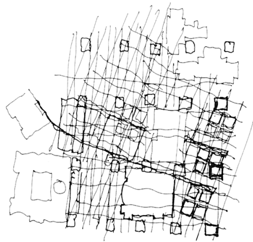
Peter Eisenman, Sketch for the Wexner Center, 1989