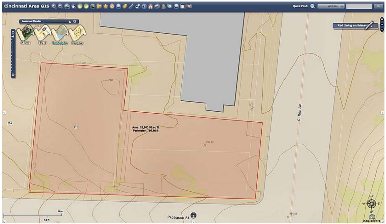
Detailed Site Plan